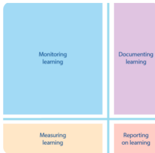
Figure 1 Weighting of assessment types